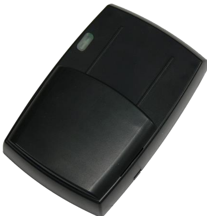
Figure 1 – ADM20 general view

The Radio Frequency Identification system might be used both within a monitoring unit or independently. When using the system within a monitoring unit, the data received from the tags and cards are transmitted to the subscriber's tracker via RS-485 interface.