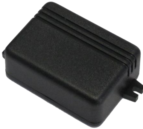
Figure 2 – ADM21 tag general view